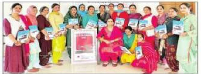
आयोजक प्रशिक्षित महिलाओं को सिलाई किट भेंट करते हुए संवाद