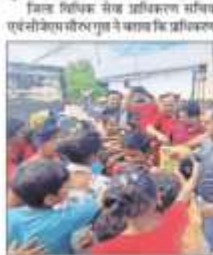
सी.जे.एम. और सी.जे.एम. ने बांटा की टीम के साथ मिलकर बांटा जरूरत का सामान

अम्बाला, 12 जुलाई ( बीभा ) : जिला विधिक सेवा प्राधिकरण सी.जे.एम. और सी.जे.एम. ने बांटा की टीम के साथ मिलकर बांटा जरूरत का सामान