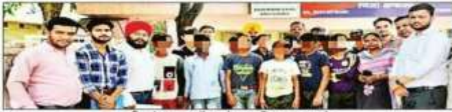
टीम के साथ मौजूद रेस्क्यू किए गए बच्चे