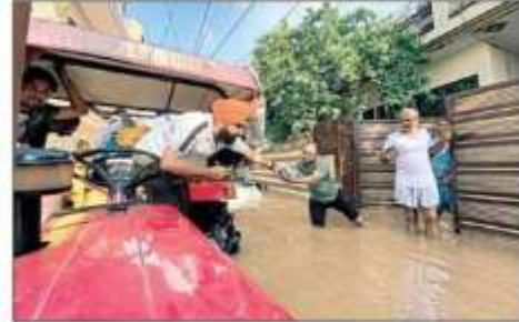
आपदा में फंसे लोगों तक जिला युवा विकास संगठन द्वारा पहुंचाई जा रही हरसंभव मदद

अम्बाला, 12 जुलाई ( बीभा ) : जिला विधिक सेवा प्राधिकरण सी.जे.एम. और सी.जे.एम. ने बांटा की टीम के साथ मिलकर बांटा जरूरत का सामान