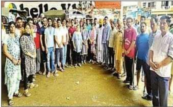
जिला युवा विकास संगठन के स्वयंसेवक।