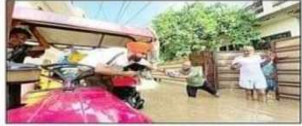
सेवा में जुटे जिला युवा विकास संगठन।