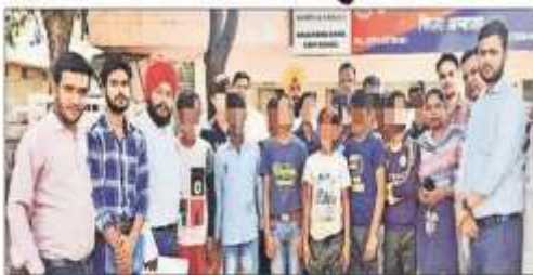
संयुक्त टीम द्वारा रेस्क्यू किए गए 15 नाबालिग बच्चों