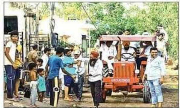
बाढ़ पीड़ितों को दूध बांटने संगठन सदस्य।