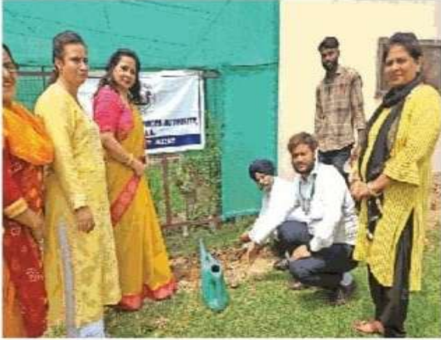
पौधरोपण करते चाइल्ड लाइन पदाधिकारी व कालेज प्राचार्य। • विज्ञापित