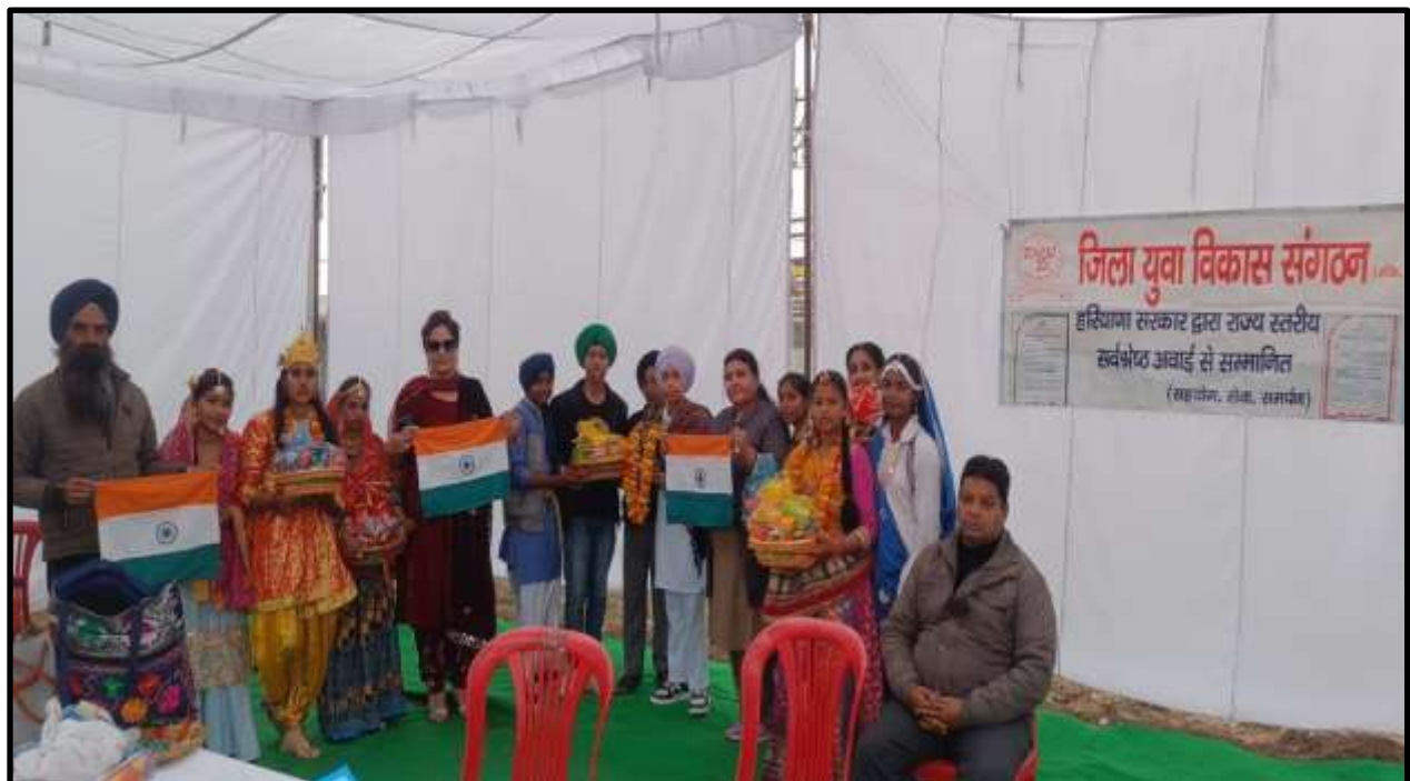
Women studying in tailoring schools run by the Zila Yuva Vikas Sanghthan Ambala presented their spirit of serving the country by making national flags and distributing them free of cost to the people at the International Geeta Jayanti Mahotsav, Ambala.