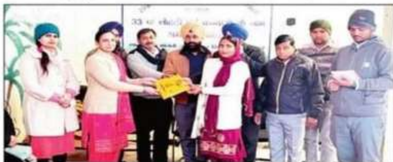
महिलाओं को सम्मानित करते संगठन के सदस्य।