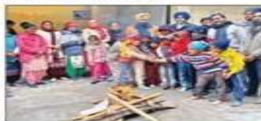
महिलाओं को सम्मानित करते हुए विशिष्ट अतिथि व संगठन के पदाधिकारी तथा लोहड़ी मनाते हुए गण्यमान्य।